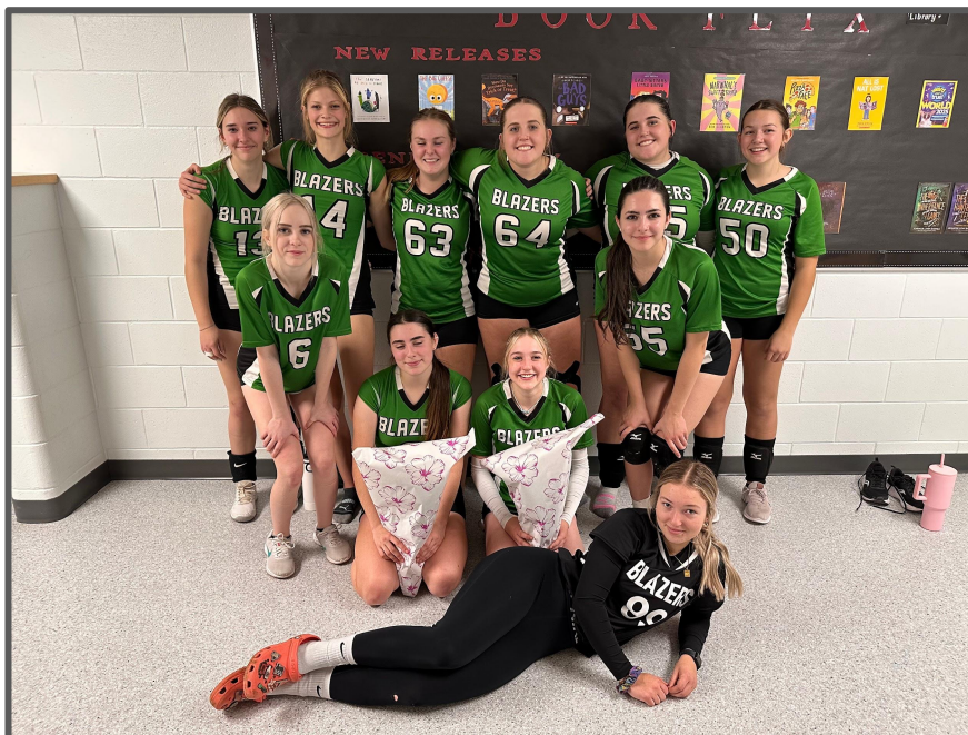
BGS Sr. Girls Volleyball - 2024/25