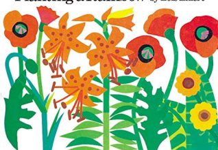
Planting a Rainbow by Lois Ehlert

An array of collages follows the progress of a mother and daughter as they plant bulbs, seeds, and seedlings and watch them grow into a rainbow of colorful flowers. PLANTING A RAINBOW is a great book to discuss all things spring when it comes to planting beautiful flowers. Are you starting your planting this Easter weekend? If not, there are lots of great craft activities to do when it comes to rainbows and planting season!!